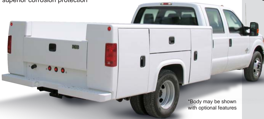
*Body may be shown with optional features